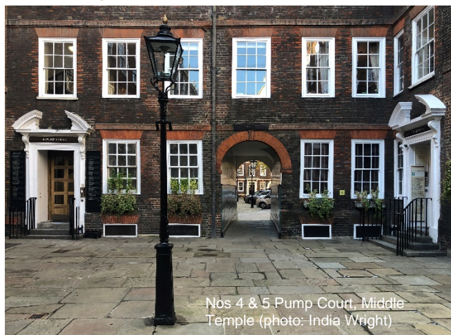
Nos 4 & 5 Pump Court, Middle Temple