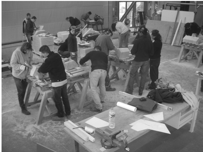
Figure 2. Cutting of voussoirs

The flat vaults built at GAIA, on a square plane with sides of 2.4 to 3 m, comprised 36 to 81 voussoirs (of about 60 x 30 x 20 cm), cut in soft limestone (third choice so as not to be too expensive) from a quarry near the Pont du Gard Bridge. At the first congress on construction history in Madrid in January 2003, I ended my introductory talk on stereotomy by a brief presentation of this first vault (with sides of 2.4 m), assembled in a metallic frame (figs. 2-4).