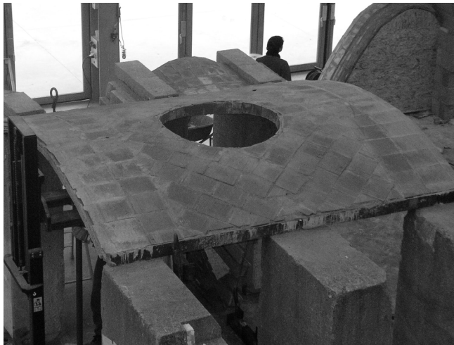
Figure 11. Catalan vaults

However, in order to facilitate and accelerate construction – and given the simplicity of the shape of the main vault – the other rows were layered using a guide.