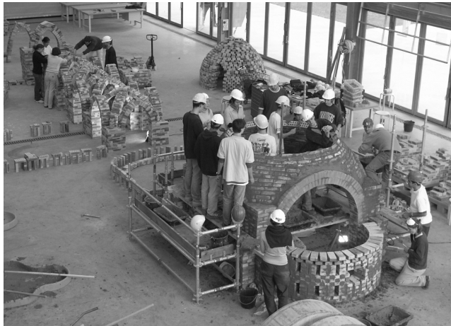
Figure 6. A pendentive cupola flanked with a cul-de-four , and exercises of dry brick assembly, without mortar

The dome was assembled with mortar made up of 80% sand and 20% clay, which allowed the disassembly and reuse of the bricks and the mortar itself. This technique, whereby materials are completely recycled, was painstakingly worked out by the CRAterre Laboratory of the Grenoble Architectural School and its use enormously reduced the cost of each of the construction experiments. It represented a great advantage since the costs of this kind of exercise can quickly become prohibitive. The construction began by mounting arcs on formers that are prepared in advance, then adding the pendentives and finally the dome itself, using a measuring rod. To allow more students to work simultaneously, we flanked the dome with a « cul-de-four ».