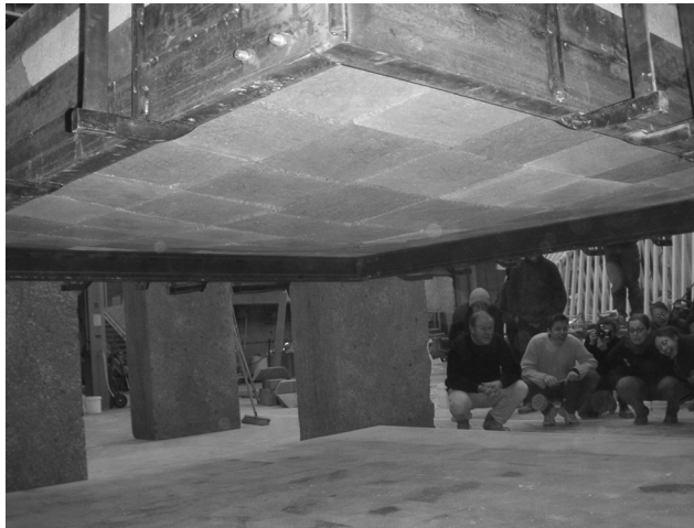
Figure 5. The underside of the vault, showing the frame beginning to bulge.

One can easily see on the photograph ( fig. 5 ) that the frame is beginning to bulge and that the vault is sagging. The problem with this type of vault is that as soon as it begins to sag, the sharp angles of the stones disintegrate - and even more so when the stone is not of prime quality. We were nonetheless able to test the vault in both directions since one of the characteristics of the flat vault is that it can be assembled both ways, with the alveoli serving either as intrados or extrados.