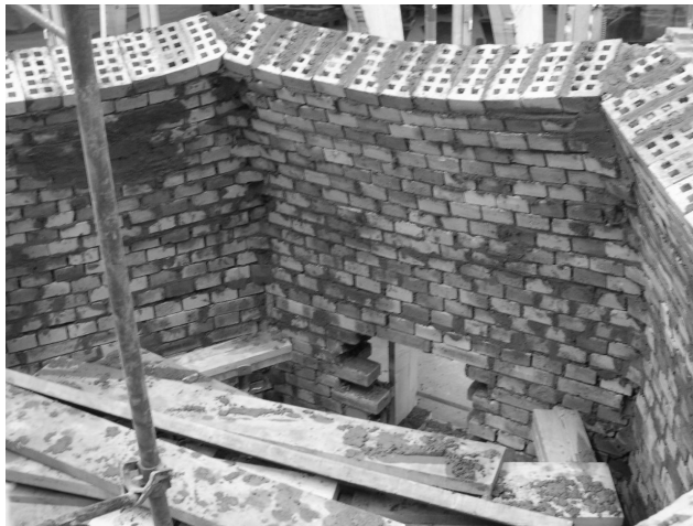
Figures 9 and 10. A polygonal cupola erected like a revolution surface dome : the bricks “festoon” and follow the cone/cylinder intersection curves

This experiment is an important example for me in more ways than one: