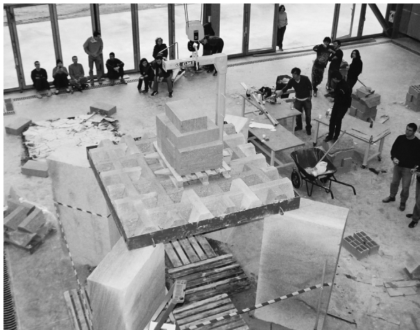
Figures 3 and 4. The planar vault in a metallic frame and load testing