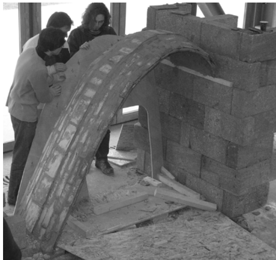
Figures 14 and 15. The construction of the subsidiaries vaults: a conoid vault and the under-face of a staircase