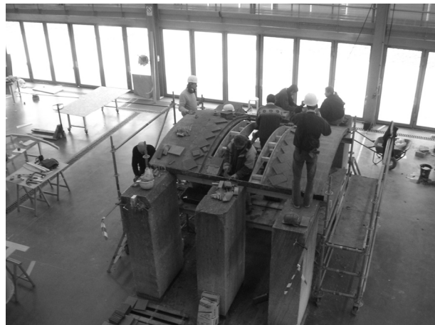
Figures 12 and 13. Construction of the barrel vault without a former or guide. The same with a guide