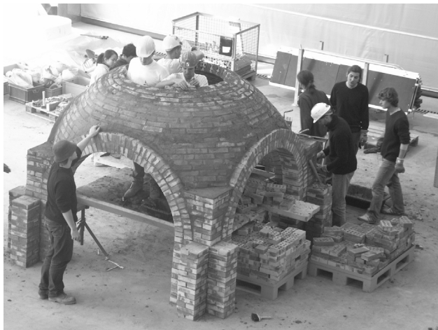
Figures 7 and 8. The construction of the cupola with clay mortar

We built a dome ( figs. 9 -10 ) of approximately the same size as the previous one (about 3 m in diameter) on a hexagonal base. I chose a hexagonal rather than an octagonal base in order to exaggerate the difference with a round dome. We then placed exterior guides in order to follow the curve of the cylinder portions of each facet and used an internal measuring rod to erect the dome as if it were a revolution surface. Having reached a certain height, one can easily see that the bricks festoon and follow the cone/cylinder intersection curves. An opening in the drum was created after