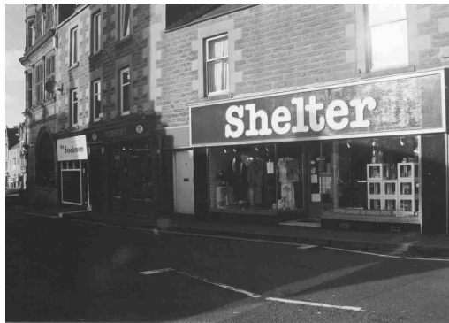
Category 2: Modernised, Sympathetic