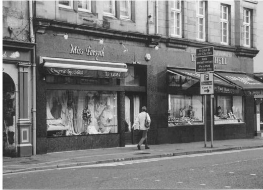
Figure 1: Photographs of Categories 1, 2, 3