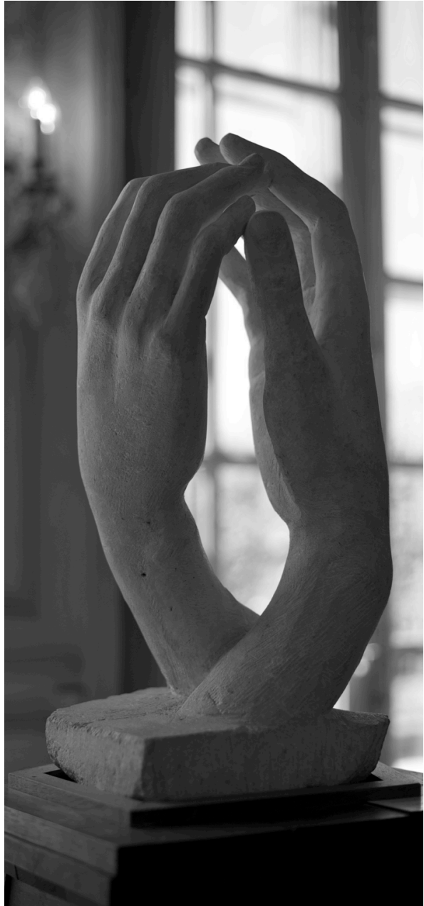
Auguste Rodin: La Cathédrale, 1908

This, then, is the fate of art when its unity is destroyed. It collapses into the arms of the photographer and the engineer or fades away into the land of dream. 1