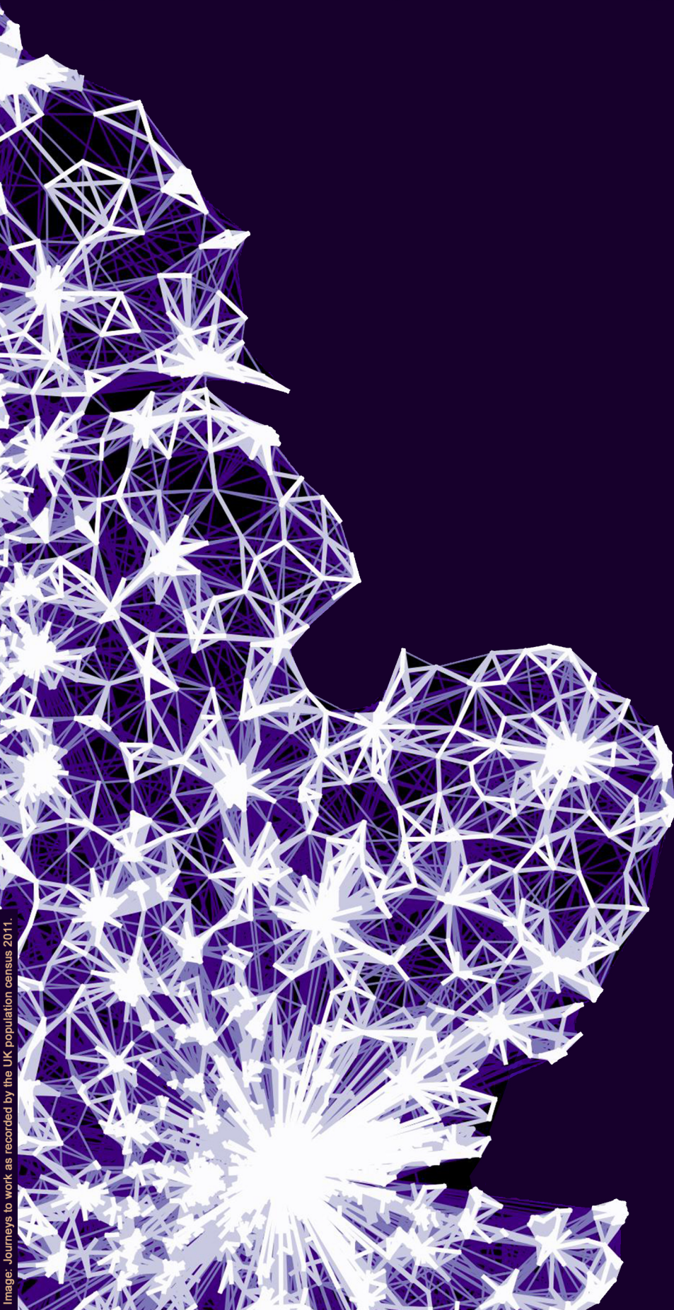
Image: Journeys to work as recorded by the UK population census 2011.

For further details web-search: AUM2018 Cambridge