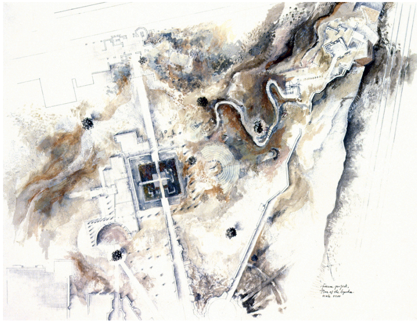
Forum the Garden , drawing A. Spanomaris