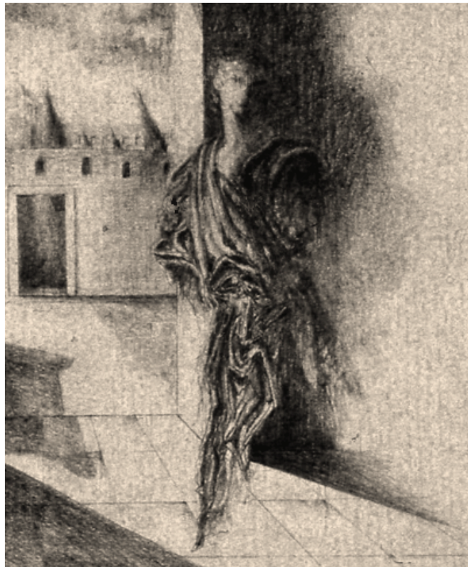
Necropolis , drawing A. Spanomaris