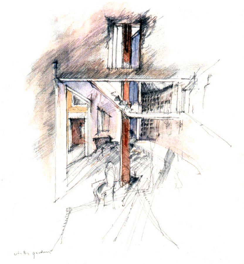
The apartment , drawing A. Spanomaris