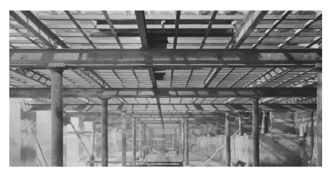
Figure 3. La Samaritaine, Paris. Architect, Frantz Jourdain. Construction of subterranean passageway showing use of steel beams, c. 1905-10. Unknown photographer, La Samaritaine Archives.