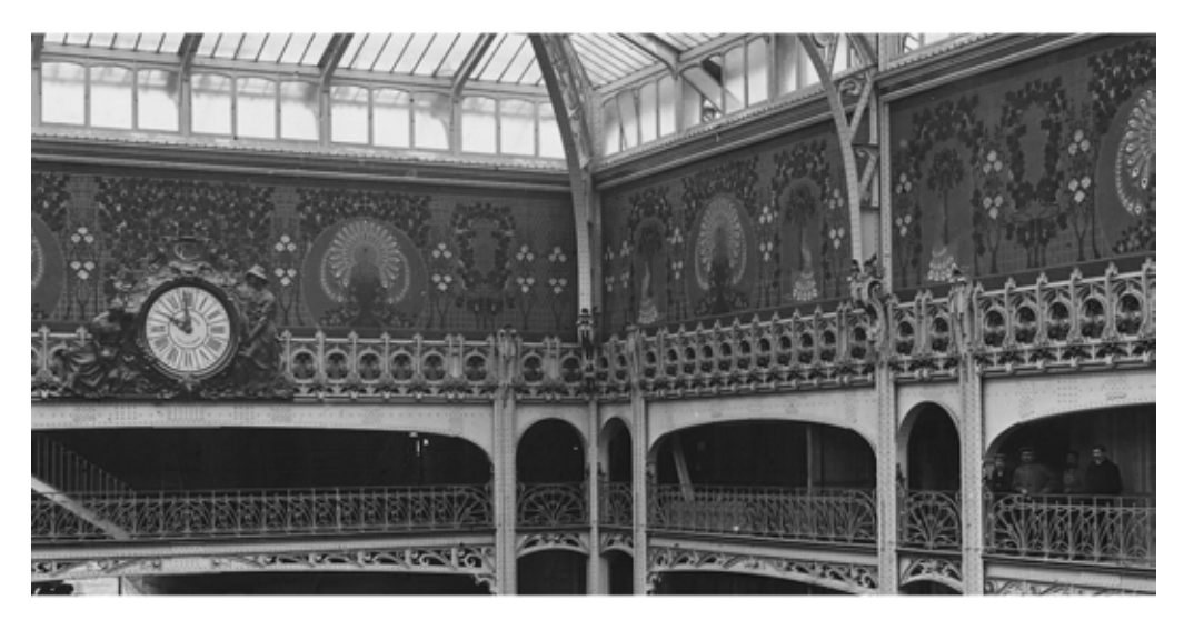
Figure 2. Magasin 2 La Samaritaine, Paris. Architect, Frantz Jourdain. Construction of main atrium using steel framing, c. 1905-10.

Jourdain went on the build a separate Samaritaine de Luxe (1914-17) near the Opera Garnier aimed at a wealthier clientele and then, after the war, began designing an extension to Magasin 2 towards the historic north embankment of the Seine – this work was eventually taken over by Jourdain's protégé Henri Sauvage, who was more diplomatic in adjusting his creative impulses to the needs of others. He designed a plainer, quasi-monumental exterior to the extended steel framing, which was clad in more respectable stone; this was seen by many contemporaries as a natural 'Art Deco' successor to Sauvage's embryonic personalised style, typified by his combined store and office block Immeuble Majorelle in pre-WW1 Paris (1913).