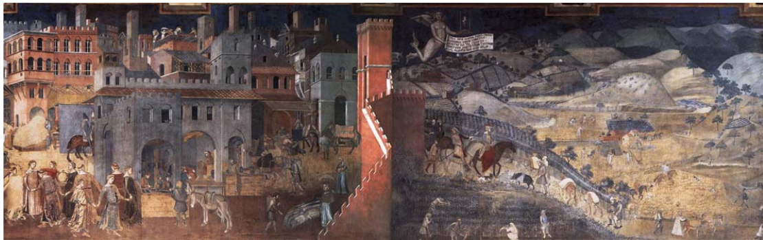
Sitopia as Utopia: Ambrogio Lorenzetti's Allegory of the Effects of Good Government , Siena 1338