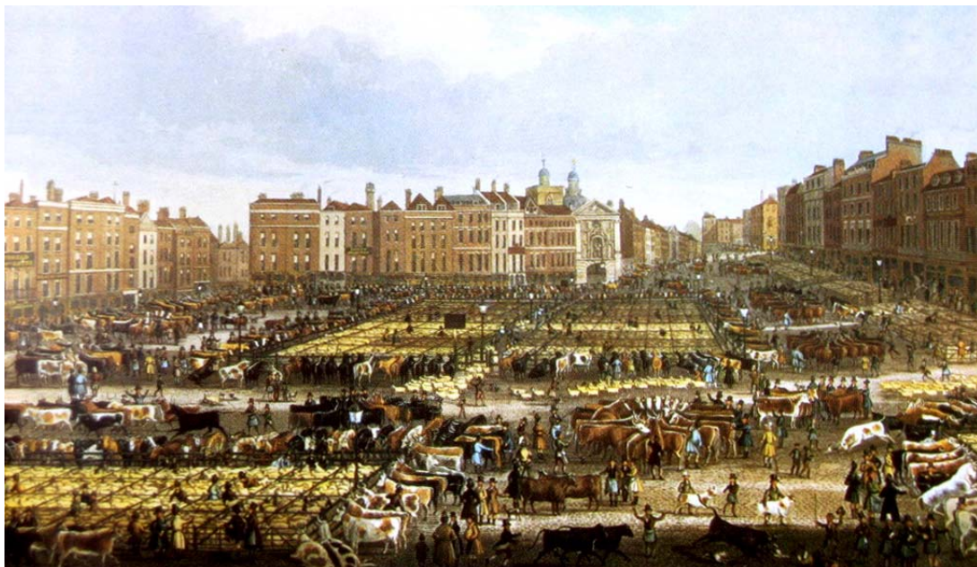
The city shaped by food: London's Smithfield Market in 1830

Hungry City , published in 2008, was my attempt to answer that question. It took seven years to write: a time of constant revelation and persistent anxiety. Within days of my 'light-bulb moment', I realised that the subject that I had stumbled upon was far too big for me to tackle: I was supremely unqualified to deal with it, yet, I also realised, few people were likely to be more so. Besides that, I was far too fascinated to stop: I knew that, after years of searching, I had finally found my metier. Sixteen years later, I feel much the same. To ask how cities are fed is a bit like asking how civilisation evolved: the question is so vast that it feels impertinent to ask; yet that is, I have come to realise, its great virtue. By thinking through food, we can address questions that we may otherwise feel unqualified to ask. Food transcends scale, time and place. It is the great connector: a metaphor for life so close to life itself that sometimes the two are indistinguishable.