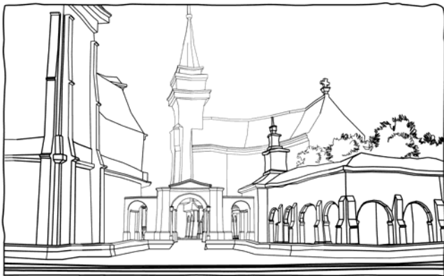
Figure 1. Cuthbert Hall College - main gate.

Plowman Court incorporates an open courtyard, a central feature of all Oxford and Cambridge colleges, and generates evocative memory pictures staged within a nocturnal exterior environment. While the spatial structure remains constant, audiovisual encounters within the environment add narrative context to the space, making it meaningful for a visitor, who can discover various dramatic events illuminating the life and history of the college. The underlying narrative pattern is based on symbolic activities - historic, social and scientific: such as 'Bumps' (rowing boat races), 'May Balls' (celebrating the end of examinations) or scholarly debates. The spatial as well as conditional organisation of these dramatic scenes uses trigger zones to activate site-specific audiovisual effects. A visitor to Plowman Court is free to explore the virtual environment, and in so doing will set off the scenes embedded there, thus generating an intrinsically non-linear narrative that crystallizes during and through the exploratory process.